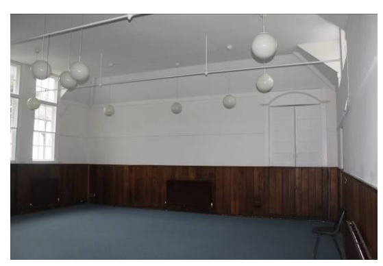
Statement of Significance

The meeting house was built in 1907 to the designs of the Quaker architect Fred Rowntree. The building is an attractive product of the Edwardian Arts & Crafts movement and contains some of the original meeting room chairs. There have been some minor internal alterations but the building is still of high heritage significance.